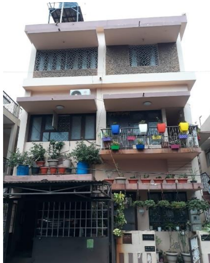
Figure 4: Image of the house before renovation and retrofit, 2021