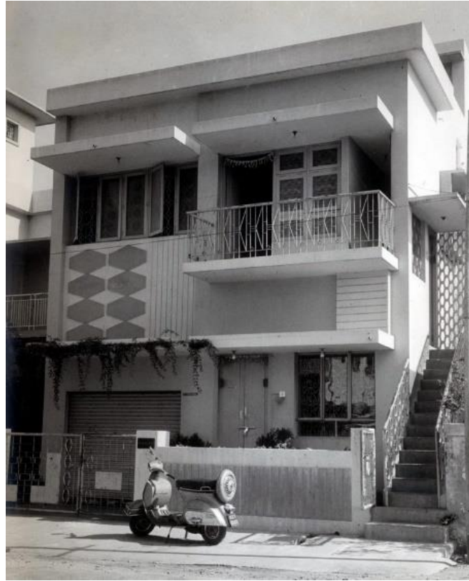
Figure 3: Image of the house before renovation and retrofit, 1971