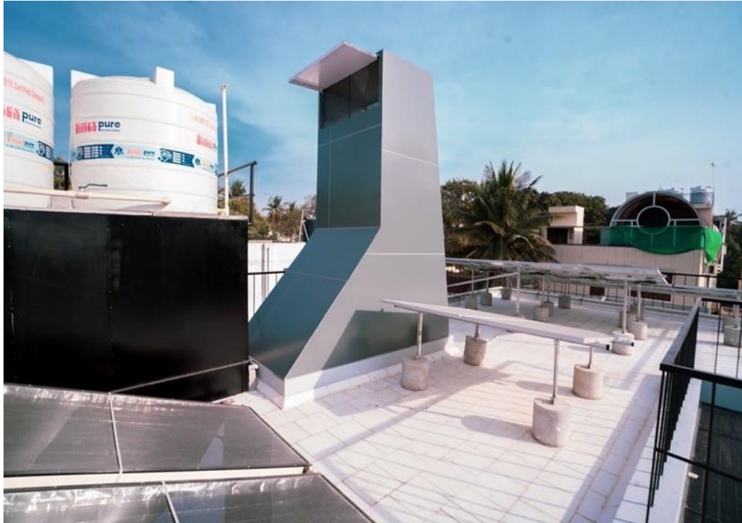
Figure 2: Photo showing the constructed Solar Chimney

Efficient systems for providing cooling, ventilation, and light. They are: