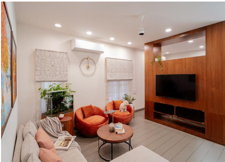
Figure 6: Interiors Now