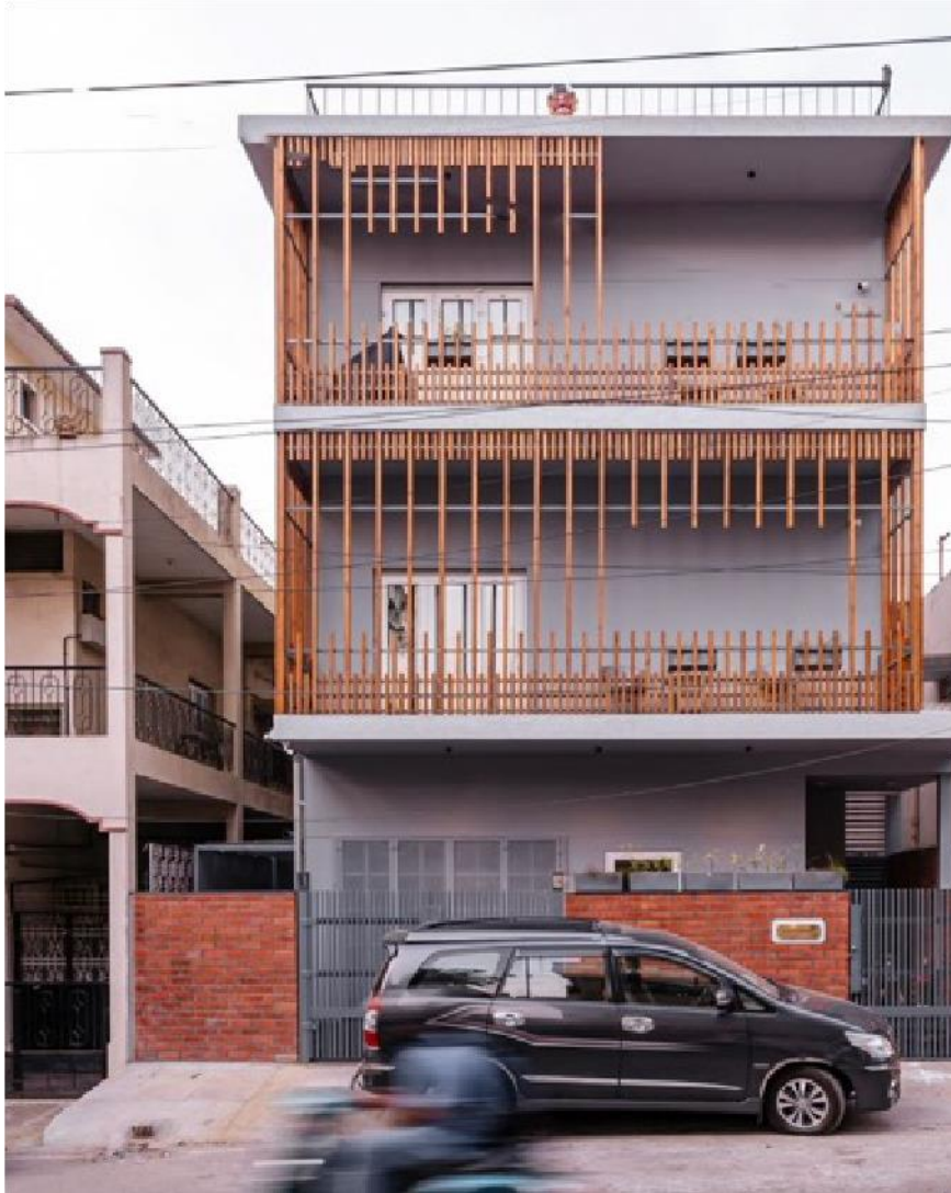
Figure 5: Image of the house after renovation and retrofit, 2023